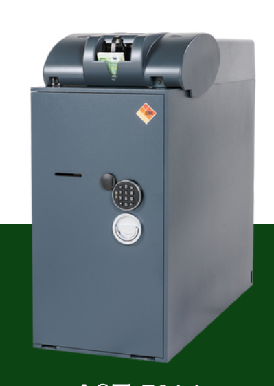
AST 7016 The most capacious and flexible TCR available. Handles and recycles up to 11,200 notes.