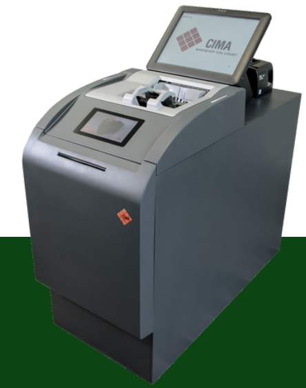
AST 9000 An all-new cassette-based TCR designed for environments where cash processing volumes are high.