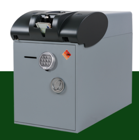
AST 7000 A low-cost, fit-for-purpose TCR that features a recycling capacity of up to 4,000 notes.